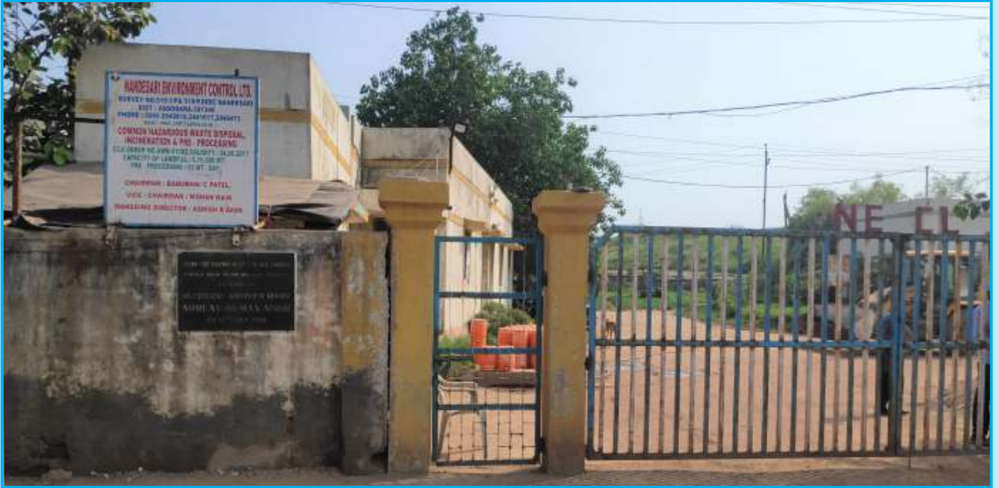
Solid Hazardus Waste Site