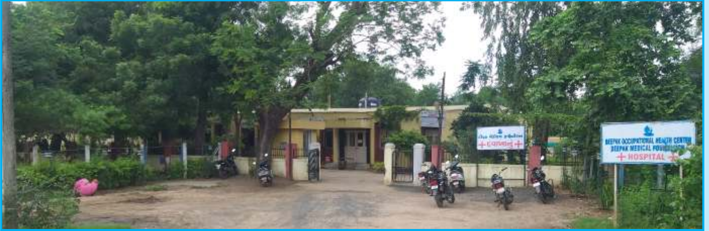
Deepak Occupational Health Centre