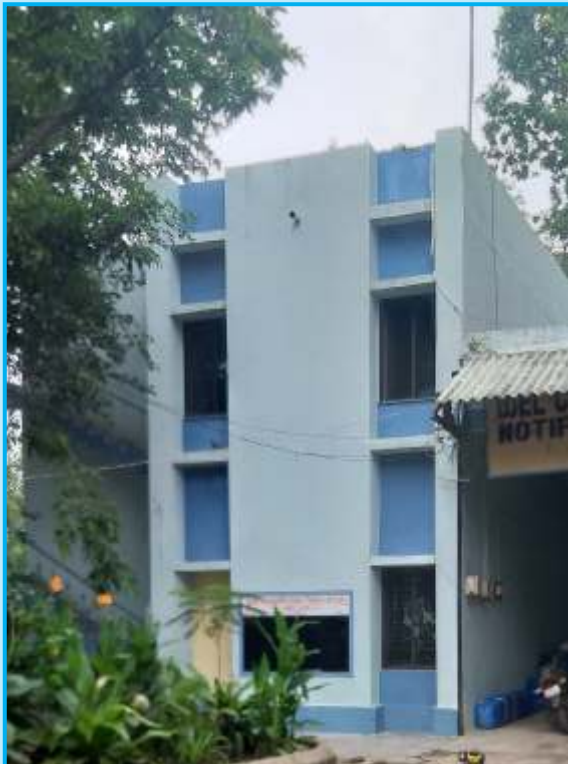
Nandesari Notified Area Authority Building