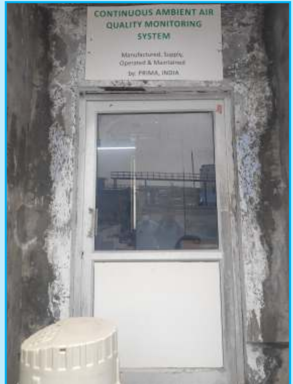
Continuous Ambient Air Monitoring System