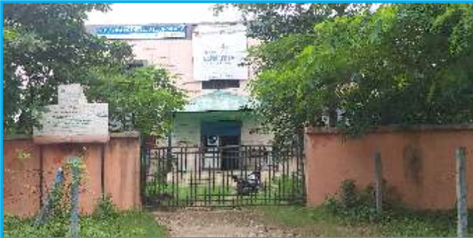
Skill Upgradation Centre