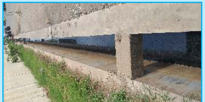
Strom Water Line