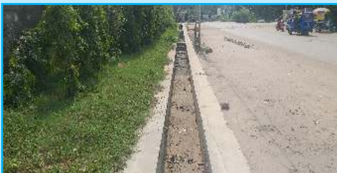
Strom Water Line