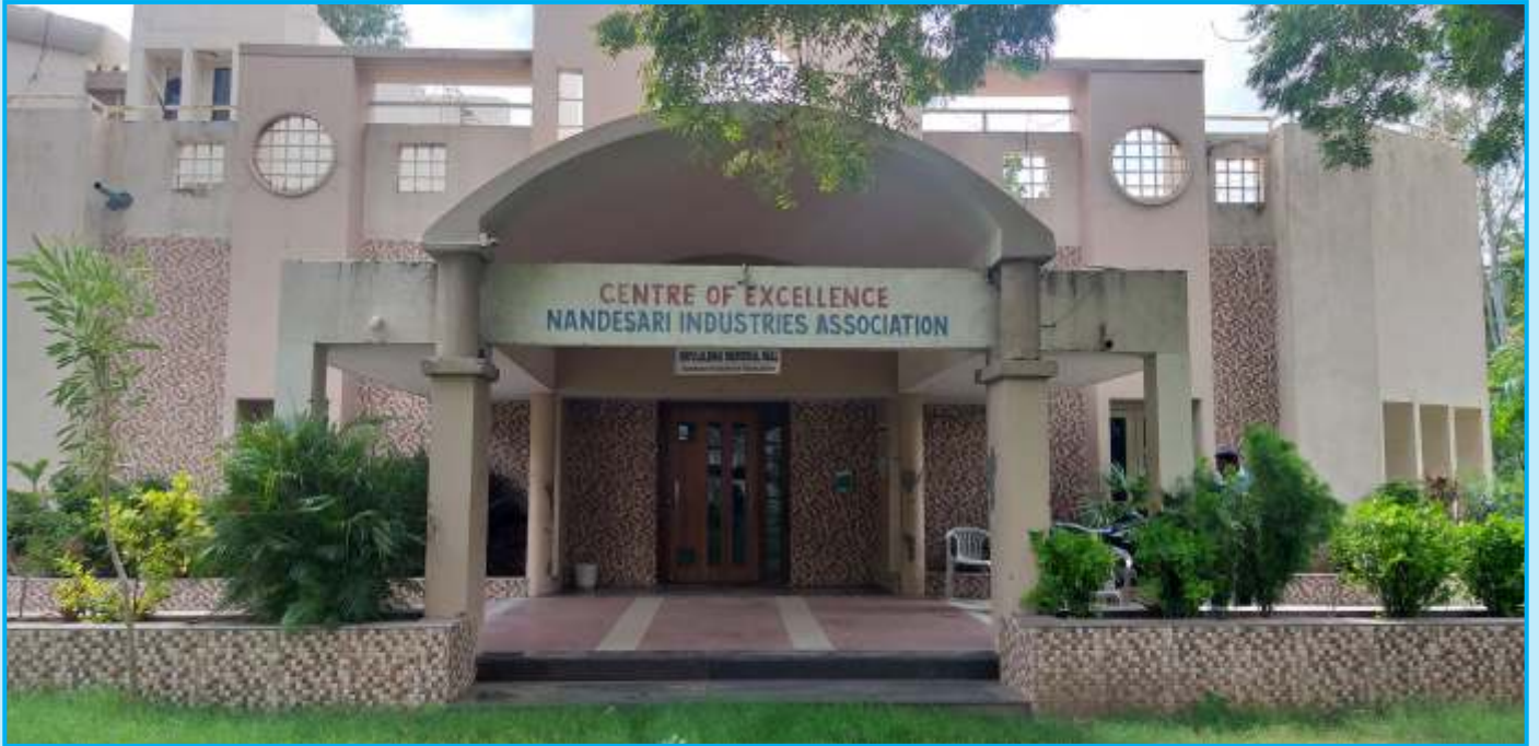
Centre of Excellence