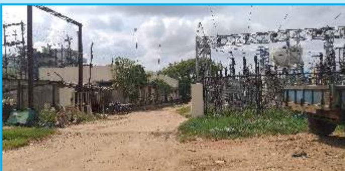
GEB Sub Station