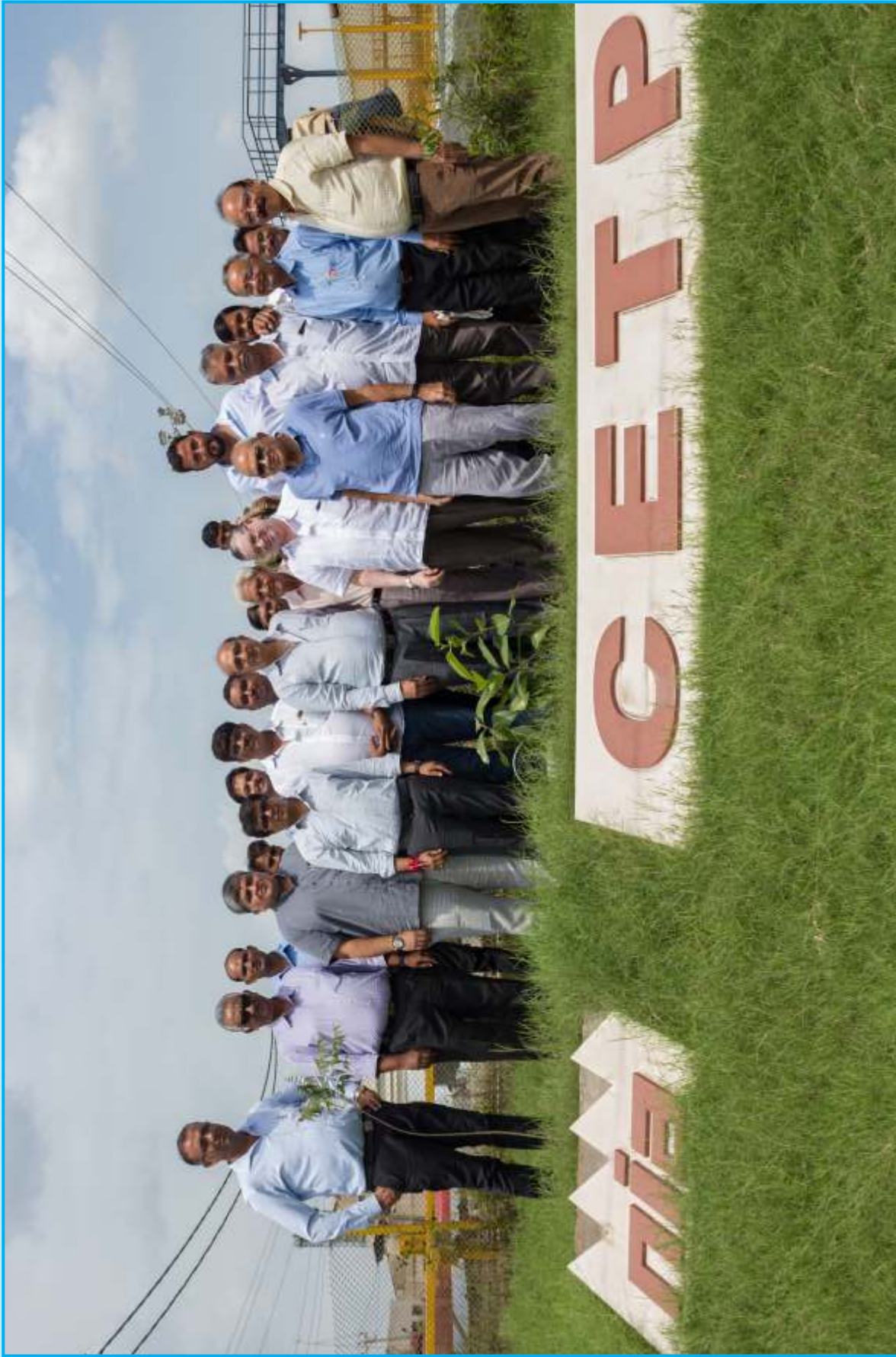
Tree Plantation at Nandesari Industries Association-Common Effluent Treatment Plant