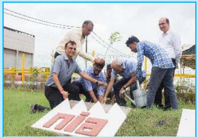
Tree Plantation at Nandesari Industries Association-Common Effluent Treatment Plant